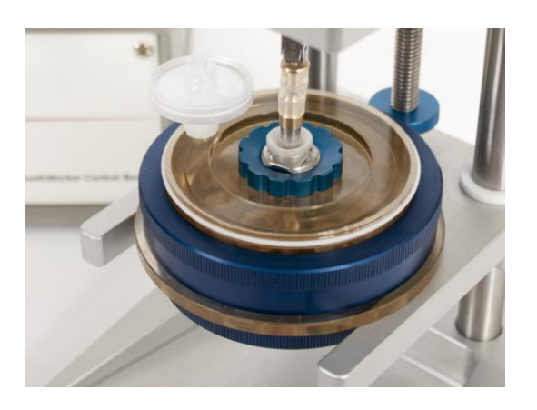
CartiGen C9-x Chamber and Stimulator

Bangalore Integrated System Solutions Pvt. Ltd. No. 497E, 14th Cross, 4th Phase, Peenya Industrial Area, Bangalore – 560 058, India Ph: +91 (80) 28360184, Fax: +91 (80) 28360047 Email: sales@biss.in